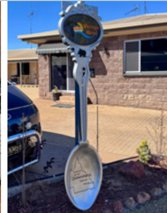
The spoon in situ