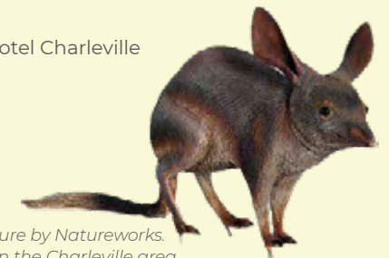
Life-sized bilby sculpture by Natureworks. Bilbies are common in the Charleville area.