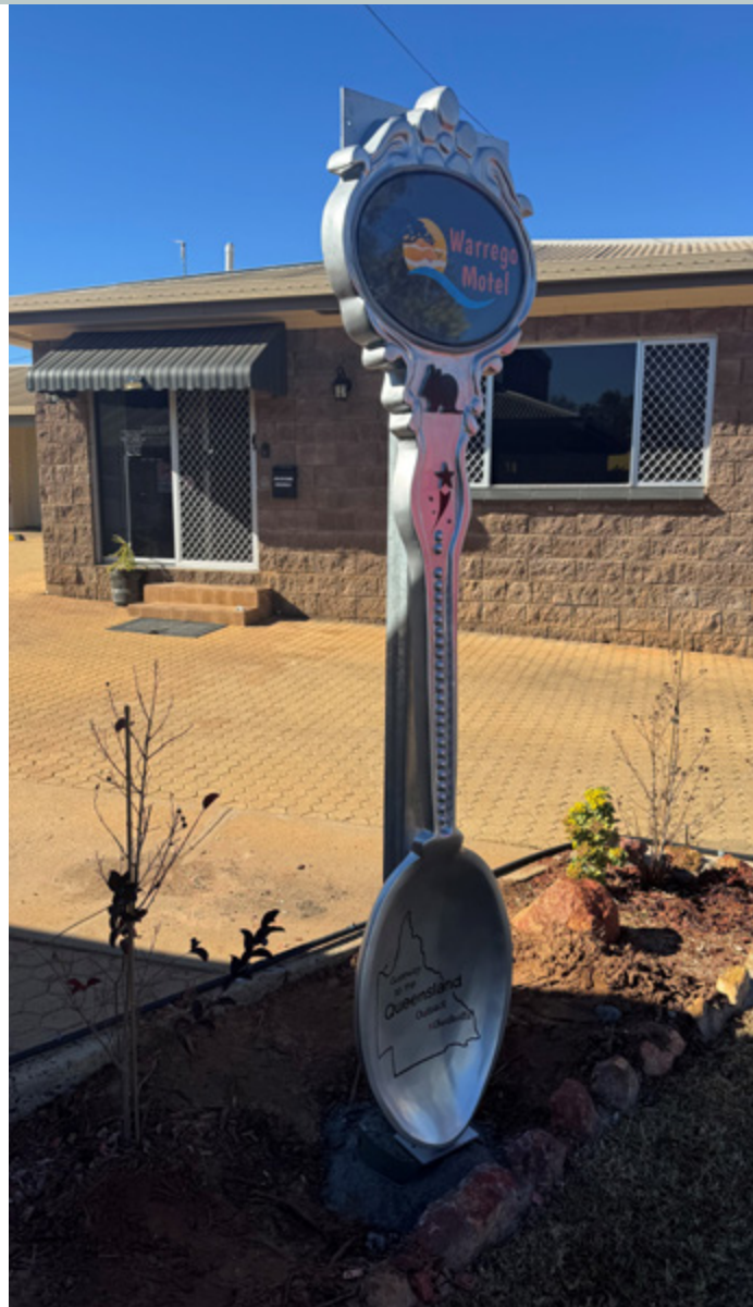
The big souvenir spoon stands at the front of the motel

Australia has quite a culture of Big Things, which are over-size sculptures that represent an object, person, animal, landmark, event or other concept. Big Things often become much-loved symbols of a business or community, drawing tourists from afar.