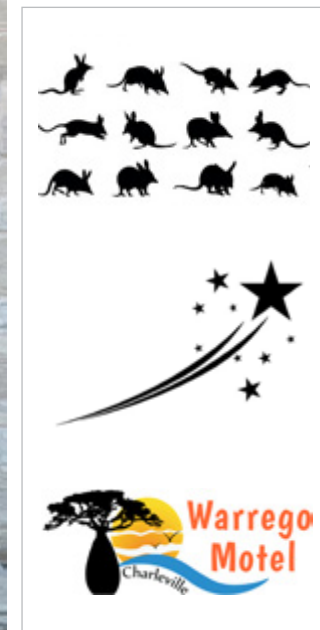
Graphics of content ideas