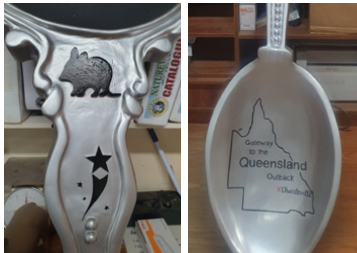
Bilby and star graphics on spoon