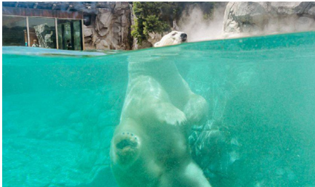
A polar bear enjoys a cool dip in the artificial rock pool