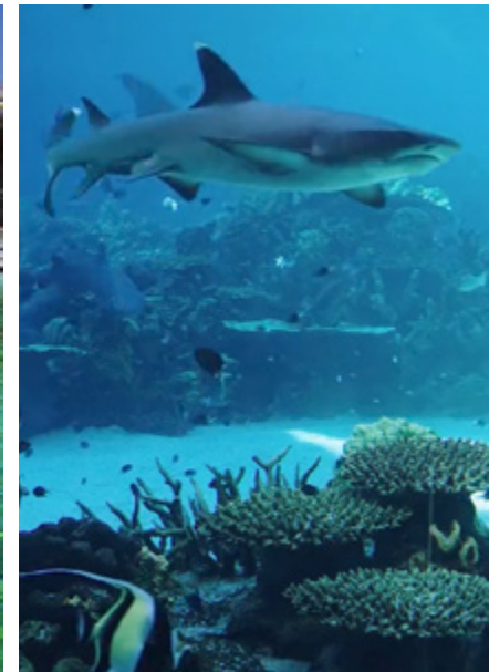
A shark glides above a coral reef