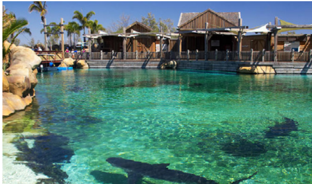
The inviting lagoon...