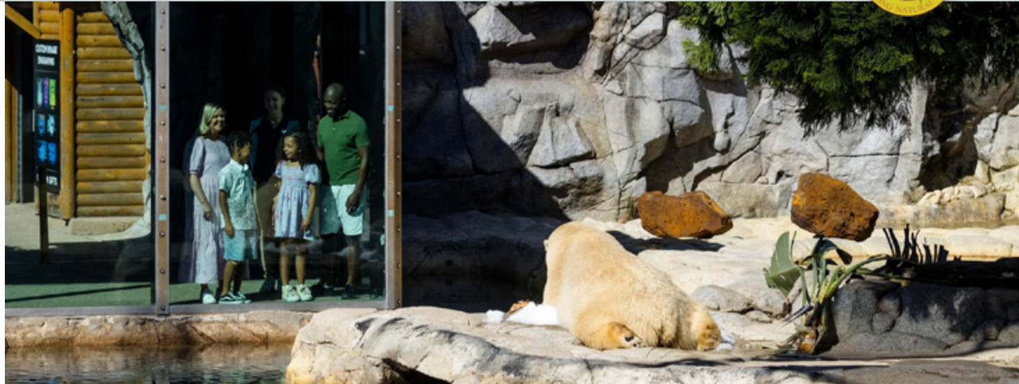
Visitors have a clear view of the polar bears basking on rocks

The artificial rock provides a solid playground for bears to climb and play, and looks real enough to immerse visitors in the Arctic experience.