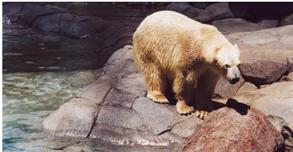
Polar Bear Shores – a polar bear explores its habitat