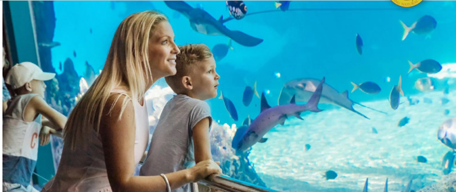
Visitors enjoy the Shark Bay viewing experience