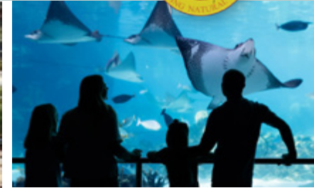
Viewing the aquarium