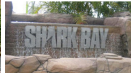
Entrance to Shark Bay