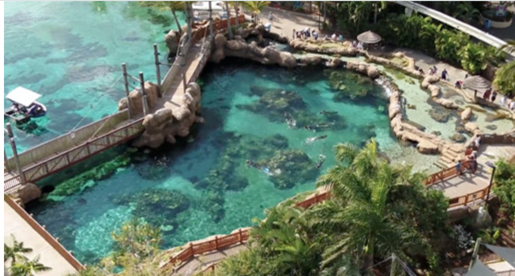
Aerial view of Shark Bay, showing the lagoon