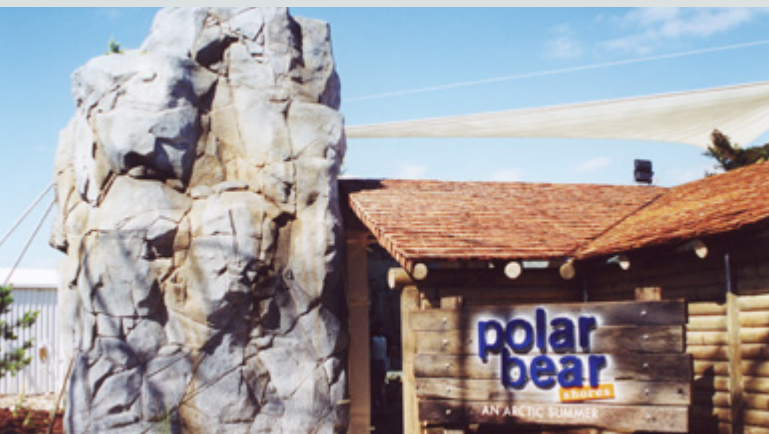
Entrance to Polar Bear Shores, with artificial rock