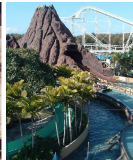
Lasseter's Lost Mine ride (now closed)