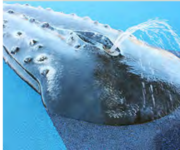
Humpback Whale Head water spout