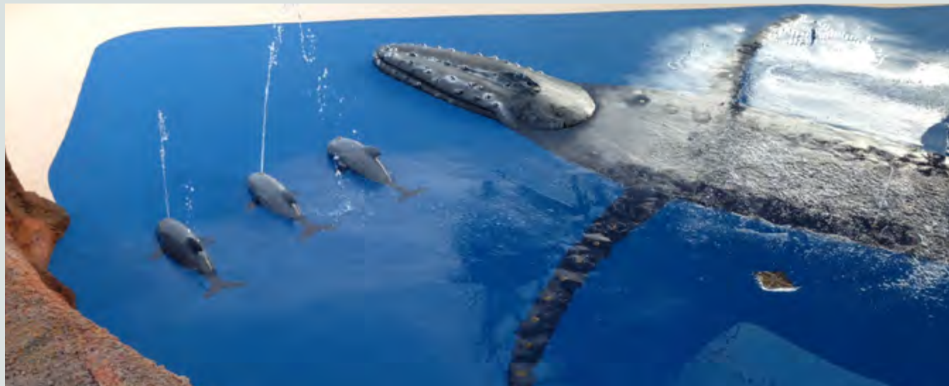
Whale Ariel View of Swimming pool - completed