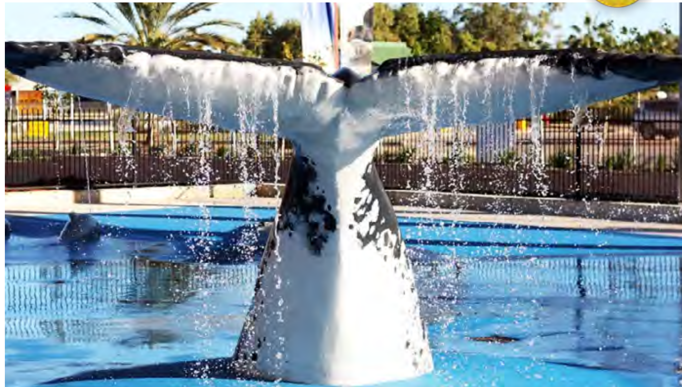
Whale Tail Custom Sculpture - Rear View