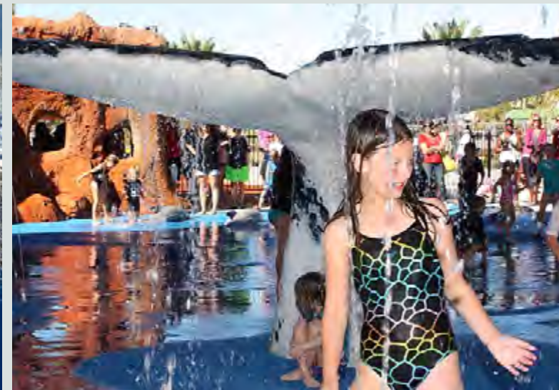
Opening day of water playground