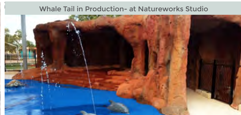
Whale Tail in Production- at Natureworks Studio