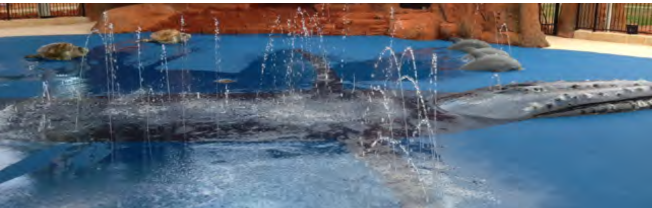
Humpback Whale Head in Situ - side view - 4.5m long