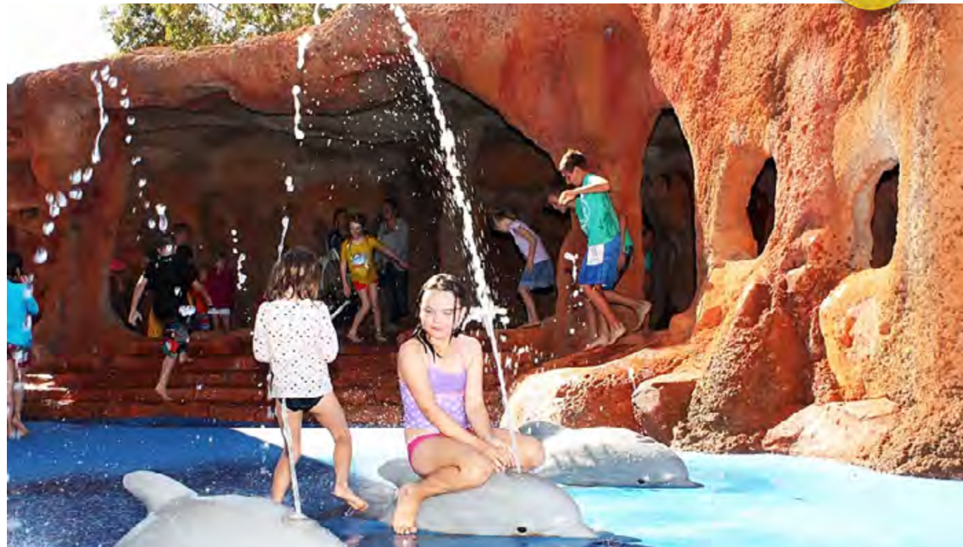
Whale Tail Custom Sculpture - Rear View

A permanent, cyclone rated curved shade structure ensure year-round access to the play area which is also fitted with coloured LED lighting.