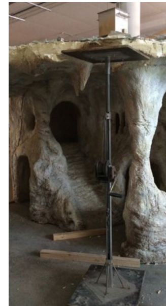
Propping up during construction