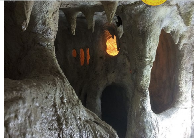
Inside the cave