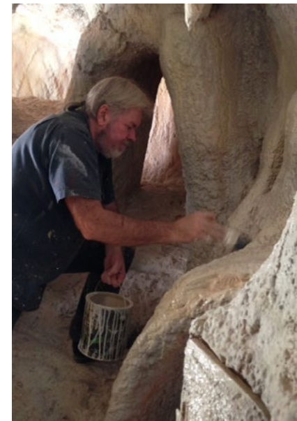
Adding finishing touches