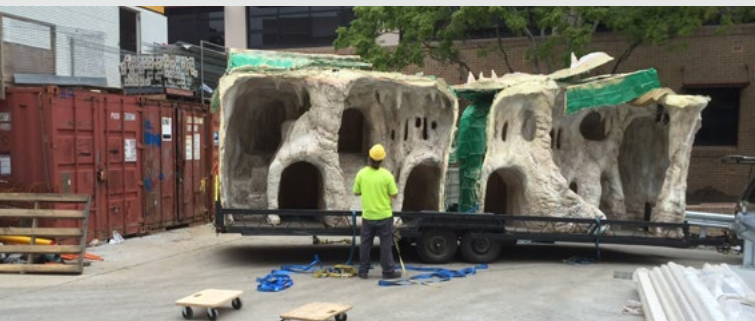
Transporting the cave in two pieces